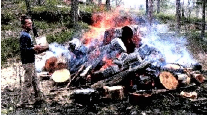
Carol Eggink and other good neighbors spent two days burning many wood piles in the same area.

Our good neighbor, Forrest Negrete, is working to clear debris piles that Mt. Bullion crews created in the CSA in March. Thank you so much!