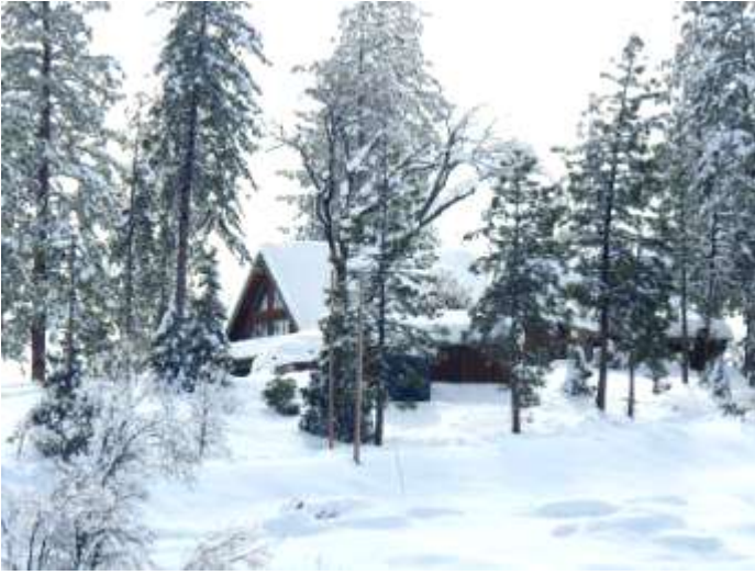
Heavy snow on many roofs created damage. Especially to the smoke stacks on metal roofs.