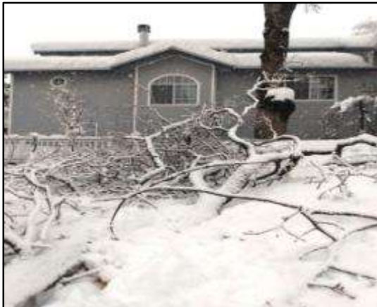
The snow broke limbs off Oaks all over the subdivision.