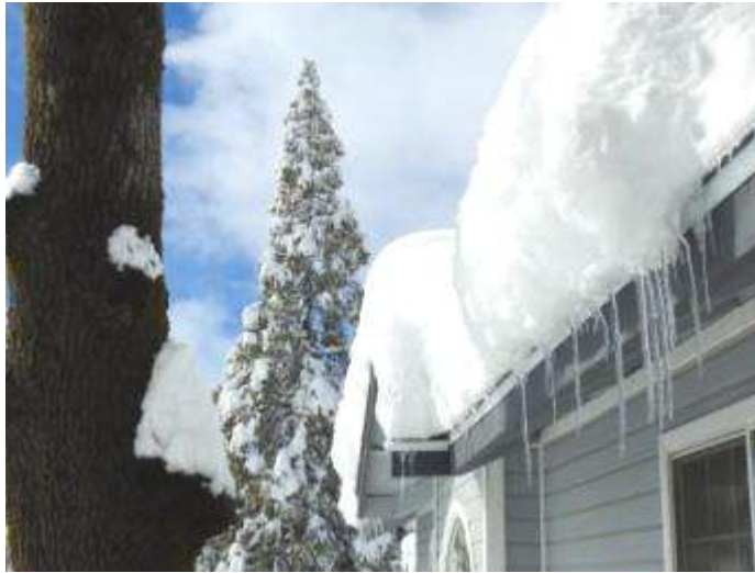
In spite of the amount of snow we received, it was really beautiful.