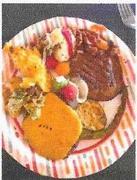
Lorraine Vance's Plate

The potluck BBQ went off seamlessly with the help of Toby Delaney and