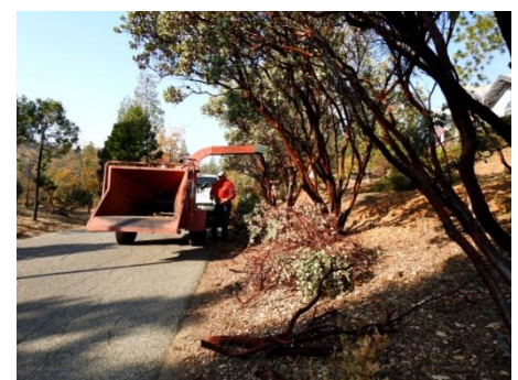
Setting up to chip