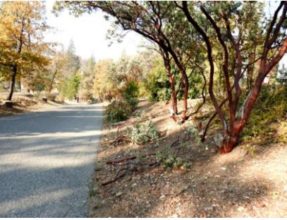
Debris staged for chipping