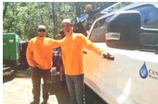
CEN CAL WATER WORKS

A water leak was discovered near the bridge while weedeating the area. This was a big job to repair. A lot of equipment was used to excavate the area to get to the broken pipe. Once the pipe was uncovered, the repairs were made. The tanks recovered to full capacity in two days.