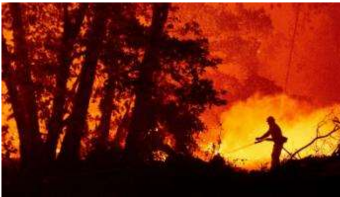
In this photo from September 7, 2020, a firefighter fights the Creek Fire in Madera County, California.

On September 3, 2017, the Mission Fire began just outside The Woods. The fire was contained on September 13 after burning 1,035 acres, threatening 237 homes, damaging four buildings, and destroying four homes in and near The Woods. At its height, 1,739 personnel fought this ferocious fire.