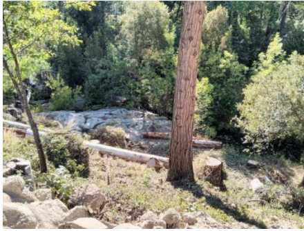
We can now see the creek again from the road.