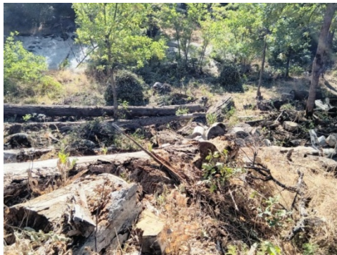
The crew uncovered a lot of downed logs. We will remove them as time and volunteers are available.